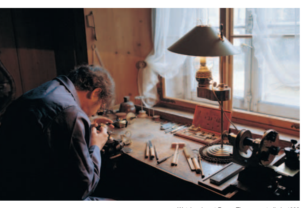
Watchmaker at Revue Thommen studio in 1932

the REVUE-SPORT wristwatches meeting the toughest demands for the first time.