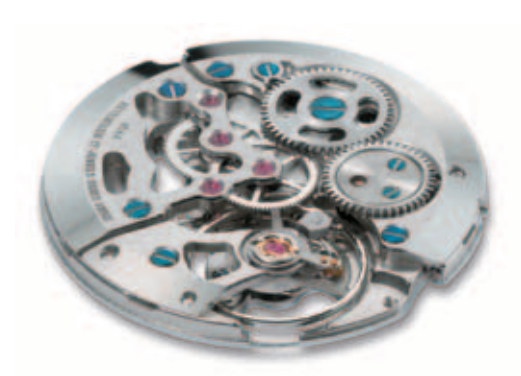
GT 44, 11 ½", hand-winding movement, with hour, minute and second hand