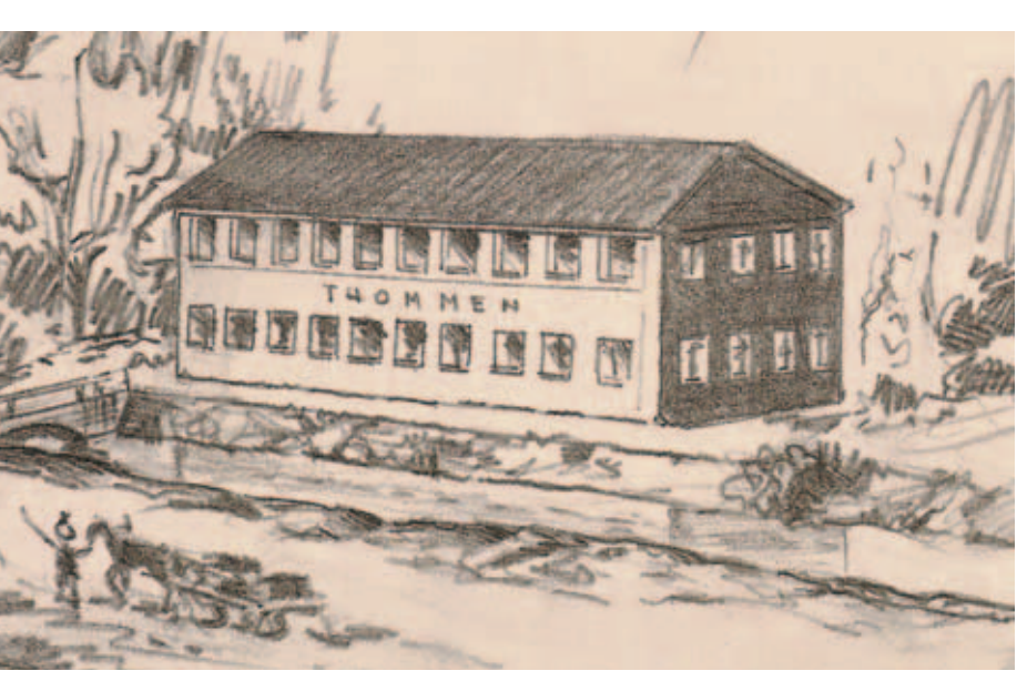
The Waldenburg factory in 1859

very modern looking mechanical digital display.