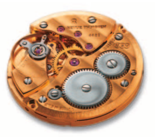
GT 82, 13'", Hand-winding movement, with hour, minute and small second hand at 6 o'clock

Since summer 2002 Revue Thommen manufacturer's movements are back in production. The