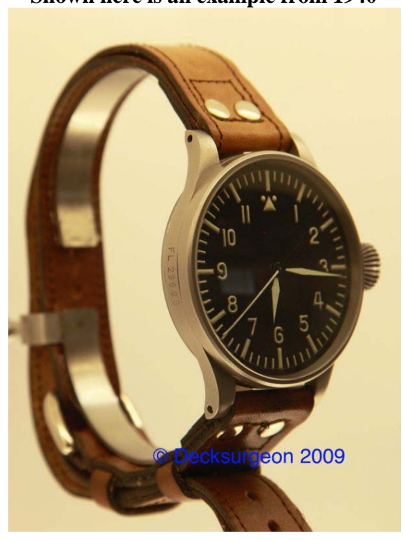
The Legendary IWC Ref 431, Big Pilot's Watch for German Air Force. Shown here is an example from 1940

The watch also had to have a "Hacking" mechanism (i.e. Second hand would stop when the crown was pulled) We take this for granted now, but back in the day the invention of stop-second itself was considered a complication on a watch. With the "hacking" feature the pilot could then synchronize his watch exactly with his counterparts or a known timing signal. Typically before a flight the watch would be synchronized with a Chronometer on the ground in the flight preparation room.