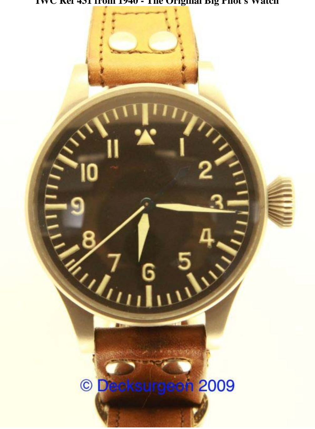
IWC Ref 431 from 1940 - The Original Big Pilot's Watch

One notable marking is the fact that "FL.23883" was stamped on the side of the case. "FL" stood for Fliegnummer (flying number) and '23' meant a device for flight monitoring. The final '883' digits were actually assigned by the German Testing Office for Aeronautics (Deutsche Versuchsanstalt für Luftfahrt).