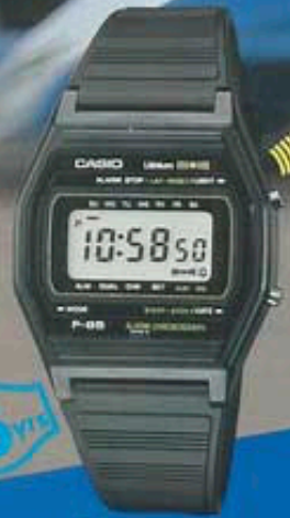
• F-85 Module No. 160 Resin Packaged in vinyl pouch shown on back page