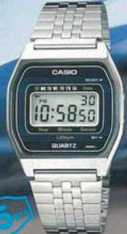
• B815 Module No. 155 Stainless steel coated case