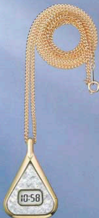
• LP-82G Module No. 85 Gold tone

Haute couture dress digitals with designs that will grace any fashion wear. Each display is mounted with clean simplicity on a crystaline pendant and comes complete with a gossamer link chain.