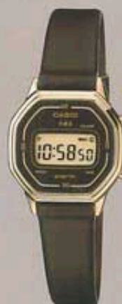
• LA650GL Module No. 156 Gold plated case