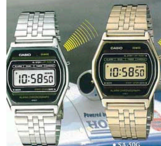
• SA-50 Module No. 145 Chrome plated

Strap yourself into the top formula in duo-watches with this analog-digital winner. It also has a full-month calendar display available at a touch.