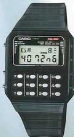
• CA-86 Module No. 134 Resin