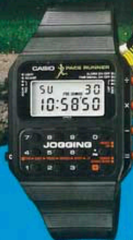
• J-100-1 (Black) -2 (Blue) -4 (Red) Module No. 183 Resin