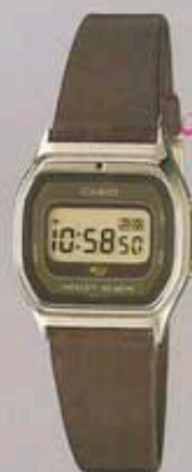
• LM-320GL Module No. 123 Gold plated case

Three catchy tunes are available in these companionable watches for daily alarm signals. There's also a stopwatch and an auto-calendar.