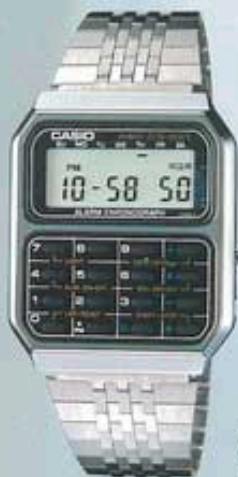
• CS-821 Module No. 231 Chrome plated