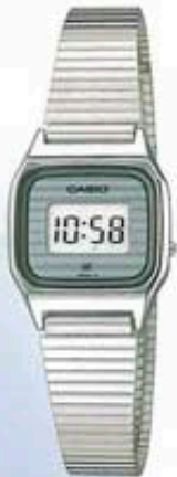
• L770 Module No. 85 Chrome plated