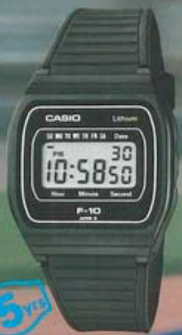
• F-10 Module No. 155 Resin Packaged in vinyl pouch shown on back page

This field of modern watches puts more individuality into watch performance whether you want to treat yourself to some real time talent with a faceful of features, or simply get a high performance, high economy time-tracker, Casio has the watch that's right. The lithium models give more mileage — with a battery life up to 5 years, while the neat low-end units are front-runners with traditional Casio style and precision.