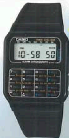
• CS-82 Module No. 231 Resin

To this very talented line-up of watches we have now added a version that's trimmed down to mere 6.6 mm. And it gets to this wafery thin size without losing any of its top-flight versatility. There's a real, finger-responsive calculator panel and full time, timing and alarm features. With the popular calculator panels of these watches comes a variety of other great ideas, like a reaction game, melody reminders and all-important date features.