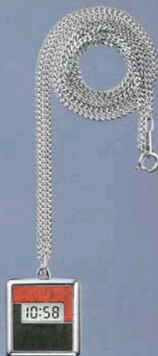
• LP-300 Module No. 210 Chrome plated