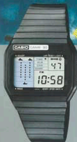
• GM-30 Module No. 222 Resin