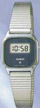
• LF100 Module No. 210 Chrome plated