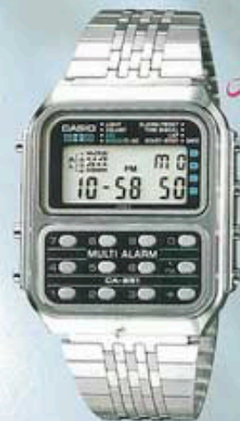
• CA-951 Module No. 166 Chrome plated