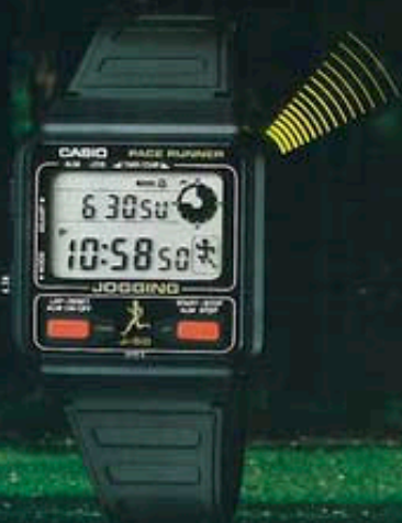
• J-50 Module No. 208 Resin

These watches take any daily jogging program in their stride. With an electronic pace-tone every step can be monitored and jogging pace can be regulated to any speed the jogger wants. The watch tells the runner his/her daily performance by automatically coordinating stride length with pace to give distance covered and elapsed time. They come in a sporty lightweight case that's never a weight to wear and also have 12/24 hour formats, full lap timing, an alarm, stopwatch and a fingertip calculator.