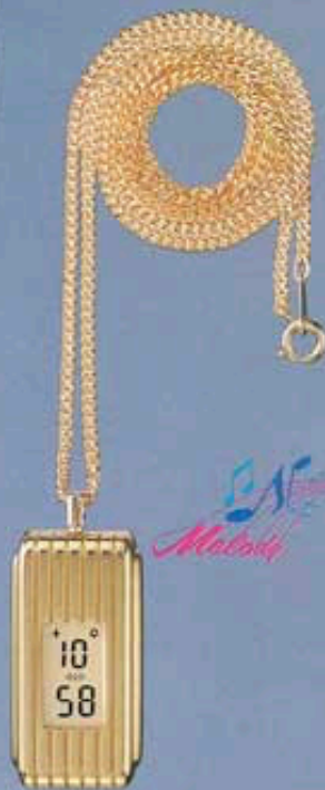
• LP-210G Module No. 191 Gold tone