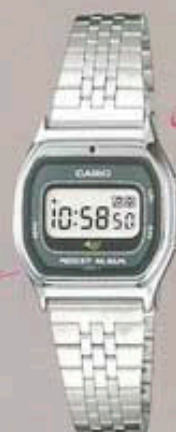
• LM-320 Module No. 123 Chrome plated