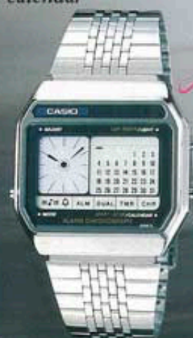
• AX-250 Module No. 118 Chrome plated

Neat efficiency for the person who wants the best in basic functions, from a very handsome watch.