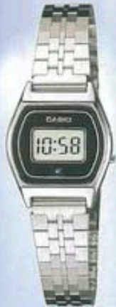
• L780 Module No. 85 Chrome plated • L780G Module No. 85 Gold plated

Sensible new watches for ladies business wear that lack nothing in chic looks and super-accuracy. They are light and slim to sit tidily on the wrist that has a busy nine-to-five office schedule.