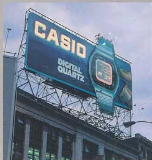
Casio says it in neon, in New York overlooking busy Times Square.

Two country-style clocks that have the wise old owl blinking and flapping away the seconds on an attractive animated display. It also features big, easy-reading digits. Controls are simple to set and, for night owls, there's a 'Snooze' function that helps bring you wide awake if you've overslept the alarm.