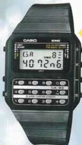
• CA-85 Module No. 134 Resin