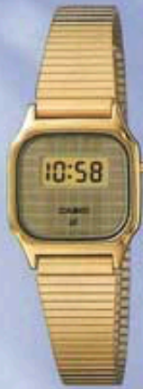
• LF100G Module No. 210 Gold plated