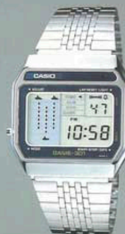
• GM-301 Module No. 222 Chrome plated