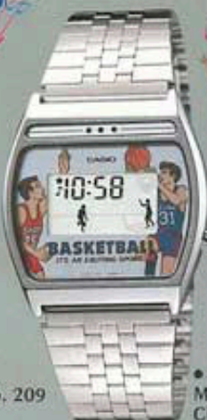
• GF-11 Module No. 209 Chrome plated