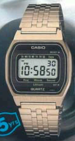
• B815G Module No. 155 Gold tone front