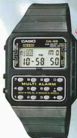
• CA-95 Module No. 166 Resin