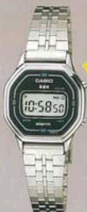
• LA650 Module No. 156 Chrome plated

An ideal watch for the working girl. Gives a daily alarm signal, all time information up to the month and an auto-calendar. Easy to set, a pleasure to wear.