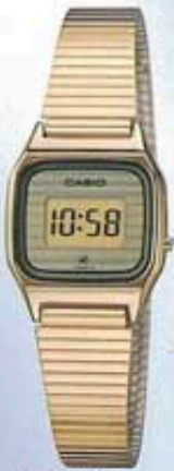
• L770G Module No. 85 Gold plated