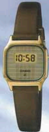
• LF100GL Module No. 210 Gold plated case