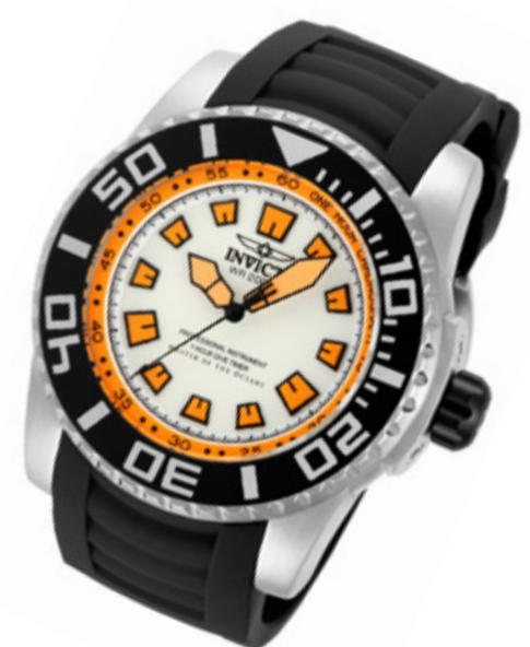
The Invicta Pro Diver Sport Model 14661