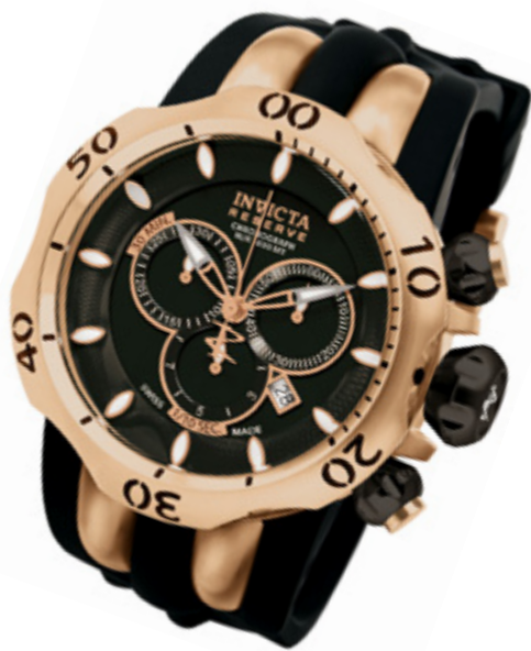
The Invicta Venom Reserve Model 10830