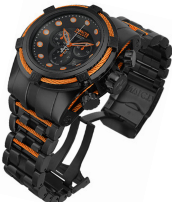
The Invicta Bolt Zeus Model 14061