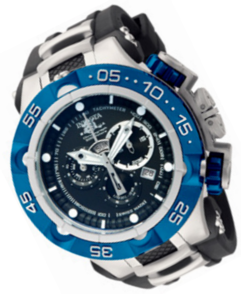
The Invicta Subaqua NOMA V Model 12881