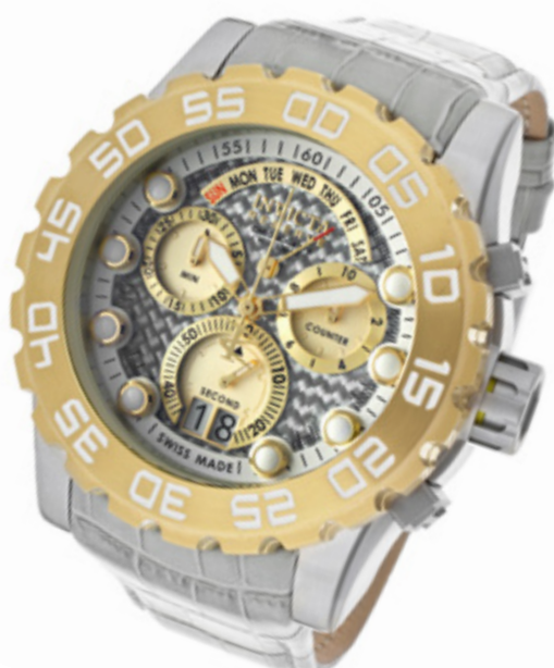
The Invicta Reserve Retrograde Model 12484