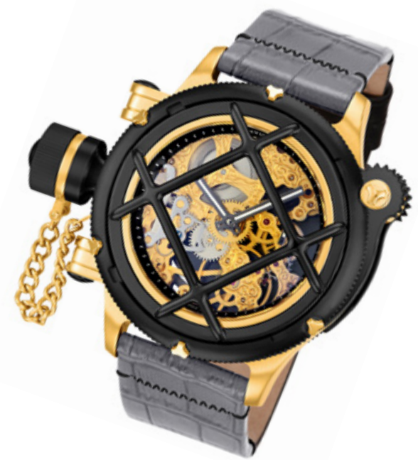
The Invicta Russian Diver Nautilus Model 14625