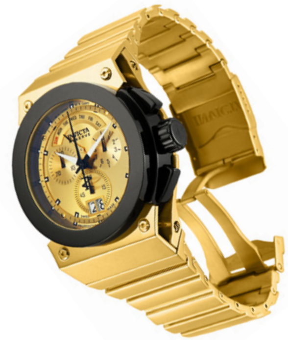
The Invicta Akula Reserve Model 14519