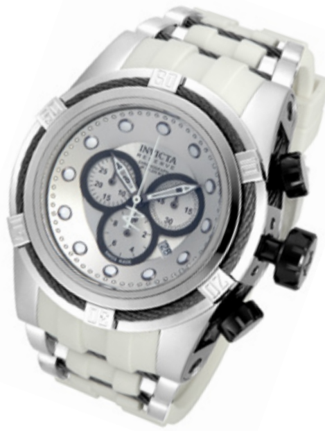
The Invicta Bolt Zeus Sport Model 14404