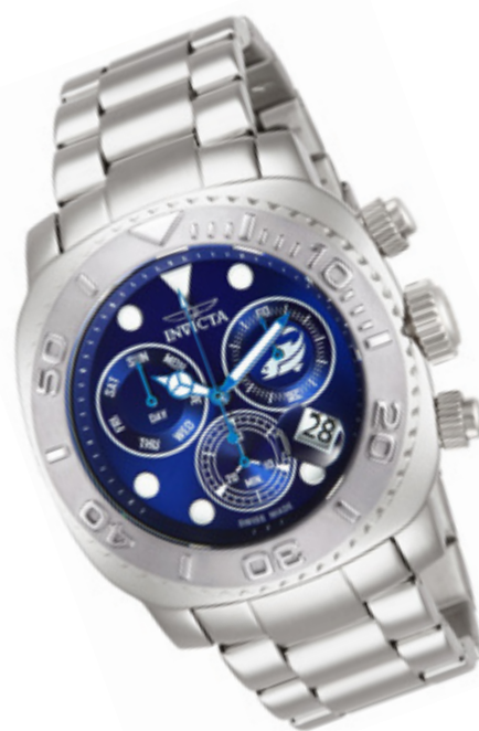
The Invicta Pro Diver Australian Model 14644