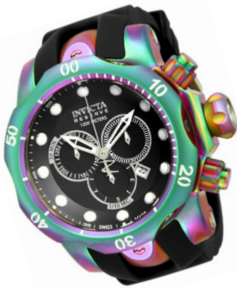
The Invicta Venom Iridescent Model 15984