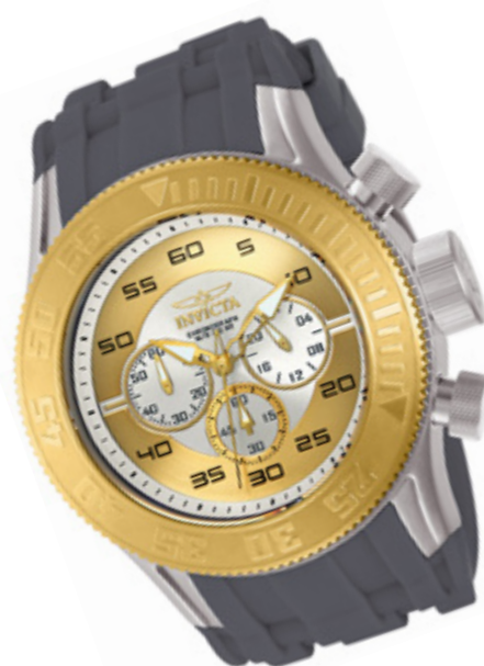
The Invicta Pro Diver Chrono Model 14975