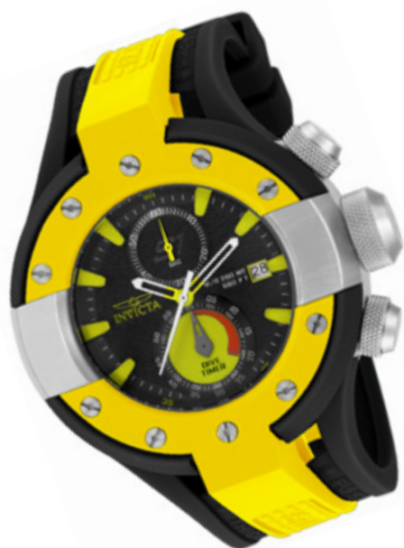
The Invicta S1 Rally Model 13061